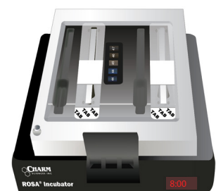
For Batch Processing

Incubate multiple strips simultaneously, then read results in the Charm EZ system.